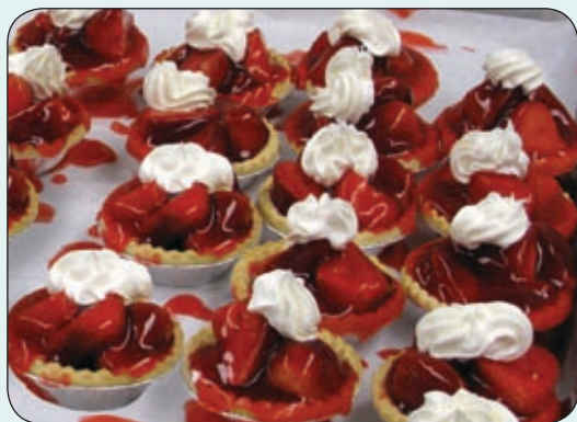
'Soup Supper', from page 1

to donor and planned giving presentations, it became evident why the organization of Palm Village currently enjoys some of the strongest financials it has witnessed in its 66-year history. The Board of Directors is grateful to a generous and committed constituency that helps make this possible.