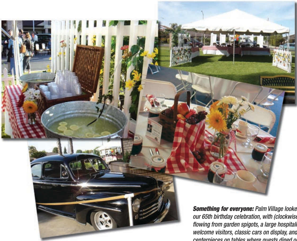
Something for everyone: Palm Village looked great for our 65th birthday celebration, with (clockwise) lemonade flowing from garden spigots, a large hospitality tent to welcome visitors, classic cars on display, and beautiful centerpieces on tables where guests dined on Tri-tip.