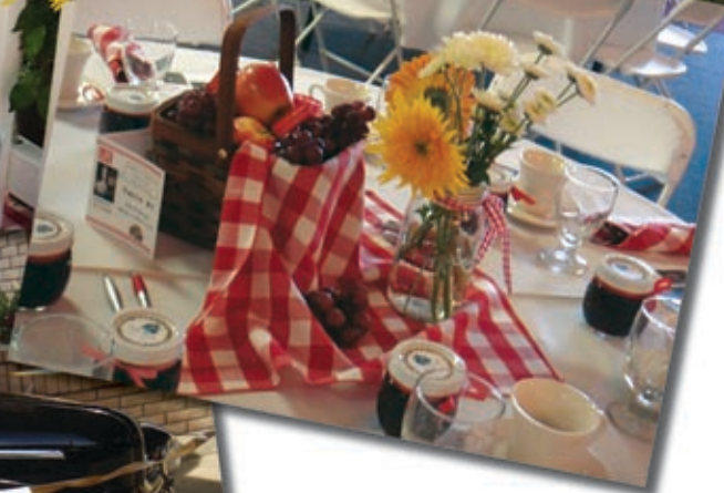
Something for everyone: Palm Village looked great for our 65th birthday celebration, with (clockwise) lemonade flowing from garden spigots, a large hospitality tent to welcome visitors, classic cars on display, and beautiful centerpieces on tables where guests dined on Tri-tip.