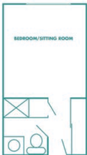
325 sq. foot suite

Immediate Availability! Call Jim Dueck today to arrange a personal visit: (559) 638-6933 (800) 928-6545